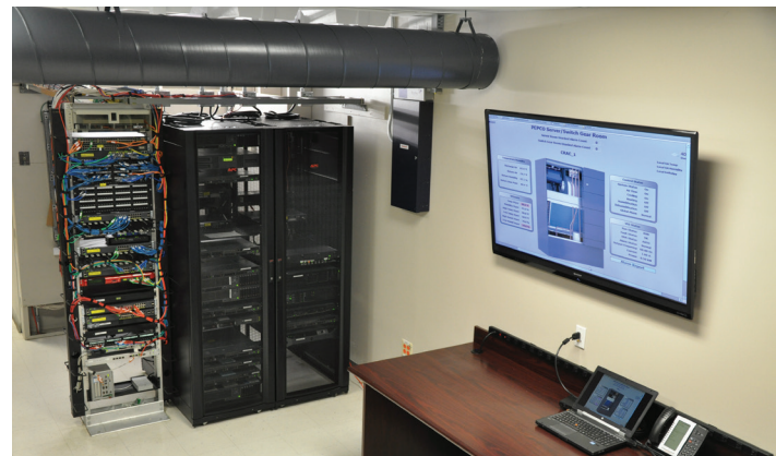
Directional air flow creates an environment suitable for the server equipment and for a workstation.

For precision cooling, the Tustin Group installed two computer room air conditioning (CRAC) units, properly sized and located relative to the equipment. The units are equipped with humidity control alert systems and online monitoring to control/monitor cooling to the server equipment. "Densely packed server racks operate continuously which creates continuous predictable heat load," explained Pappal. "This kind of heat dissipation requires redundant cooling in order to protect the equipment and ensure maximum productivity." Due to the construction of the server room, a raised floor system was not an option for air distribution. To address the room construction, the Tustin Group designed a passive air distribution system that handles both precision and comfort cooling. "Most data center applications do not account for comfort cooling," said Pappal. "However, the use of this particular server room is multifaceted. To address the customer's need, we had to get creative on the air flow distribution to accommodate both the server needs and occupant comfort." In this case, the air distribution system specifically moves air throughout the data center via a fan system, and delivers temperature-controlled air directly to the servers.