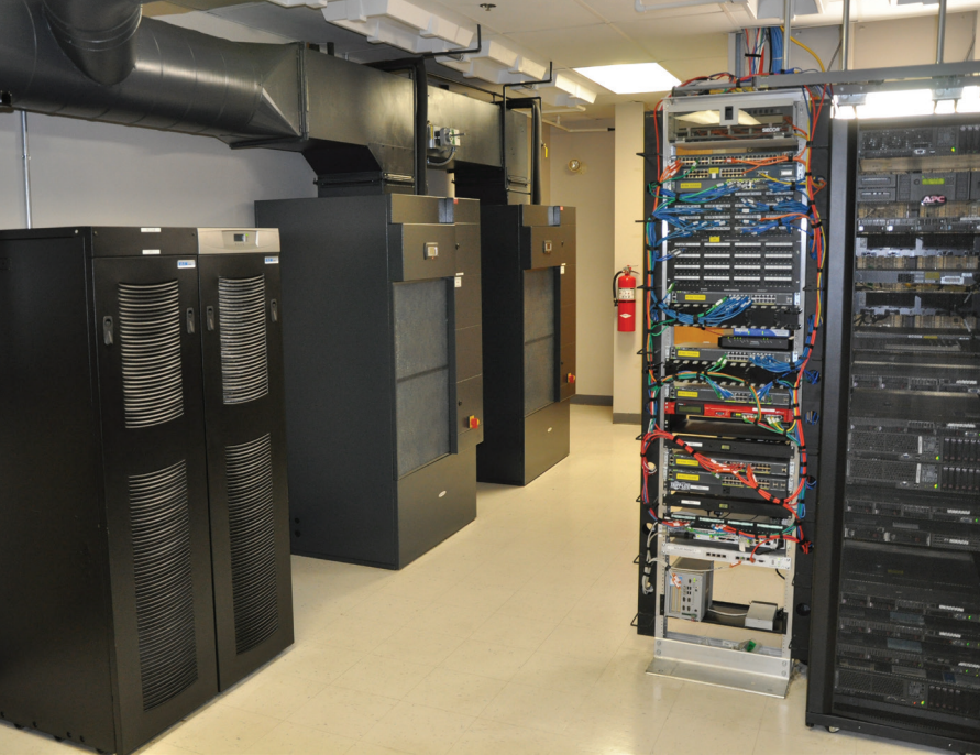
Redundant UPS Systems, Redundant HVAC, Chromatic Cabling

The densely packed server racks created predictable heat loads that required redundant cooling to protect the equipment and ensure maximum productivity.