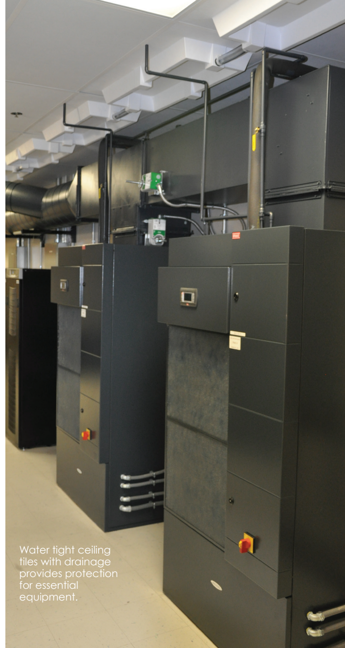
Water tight ceiling tiles with drainage provides protection for essential equipment.

To support its plant upgrade investment, PES needed to improve its legacy data center whose network of fragile systems was not robust enough to support the company's growing and expanding needs. By reconfiguring its data center and installing mission-critical mechanical and automation systems, PES is able to manage and protect its data to the highest degree possible. "The new upgrade will provide strong investment protection and will more than pay for itself by ensuring system availability in the event of component or power failures, thus ensuring continuity of service and no loss of revenue," said Negron.